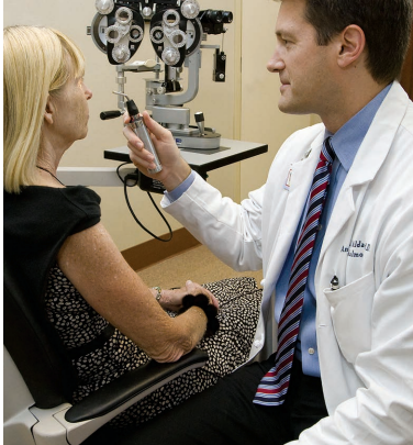
UCLA's Stein Eye Institute is a worldrenowned center dedicated to the preservation of vision and the prevention of blindness.